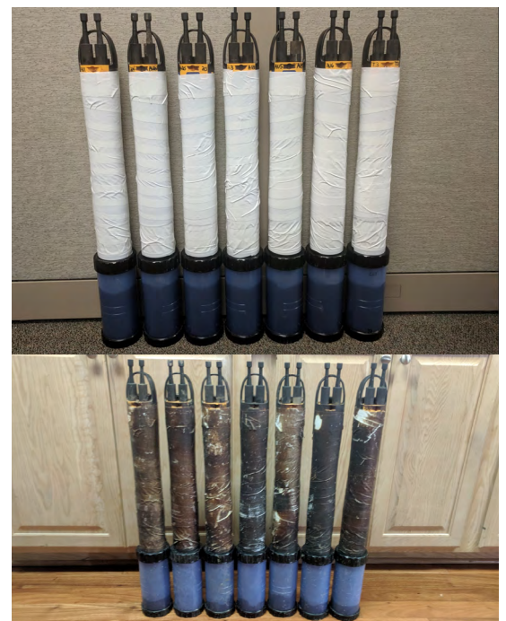
Biofouling is a constant challenge in the Atchafalaya Basin. While the automatic wiper on their EXO2 sondes keep sensors clean through long deployments, Joe Baustian and his team wrap the sondes’ bodies in plastic wrap and duct tape to keep them from becoming home to tenacious estuarine life.

Breaking the barriers to seasonal water movement will allow oxygenated, flowing water to deliver a breath of fresh air to fish and crawfish in their muddy beds. It will allow cypress forests—just inches higher in elevation—to drain for a few months so seedlings can take root and rejuvenate native stands.