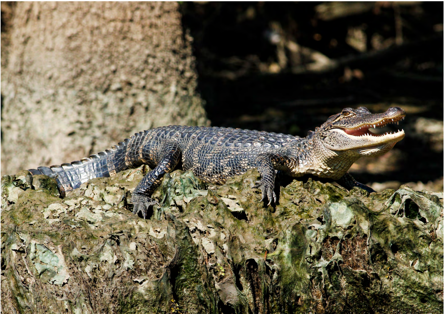
Deep mud, hidden roots, and mosquitoes—and alligators—have kept most scientists from studying the inland swamp forests of the Atchafalaya.