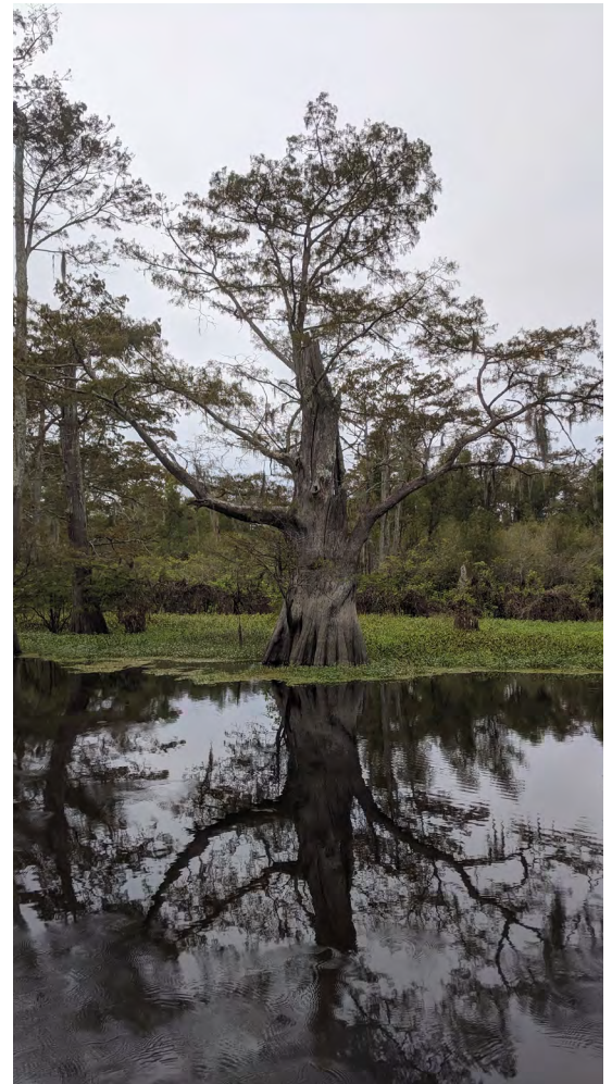
The cypress-tupelo swamps of The Nature Conservancy's Atchafalaya Basin Preserve can serve as spawning grounds, sediment and nutrient filters, and buffers against storm flows from the Gulf.