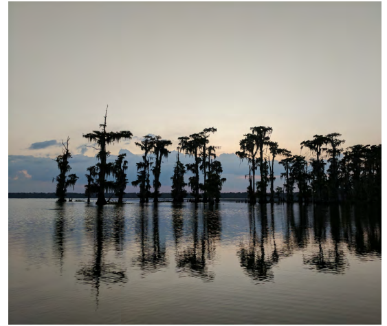
Beautiful and unique, the cypress-tupelo swamps in The Nature Conservancy's Atchafalaya Basin Preserve are yielding insights that could help guide restoration of historic flows and habitats.

Slow, meandering creeks called bayous were slashed by shipping channels and pipeline canals, their high berms ensuring that only water nearing the flood stage could even reach the swamps or drain out of them. Vast areas stagnated, turning bayous that once flowed brown with turbulent, aerated water into slack, black backwaters.