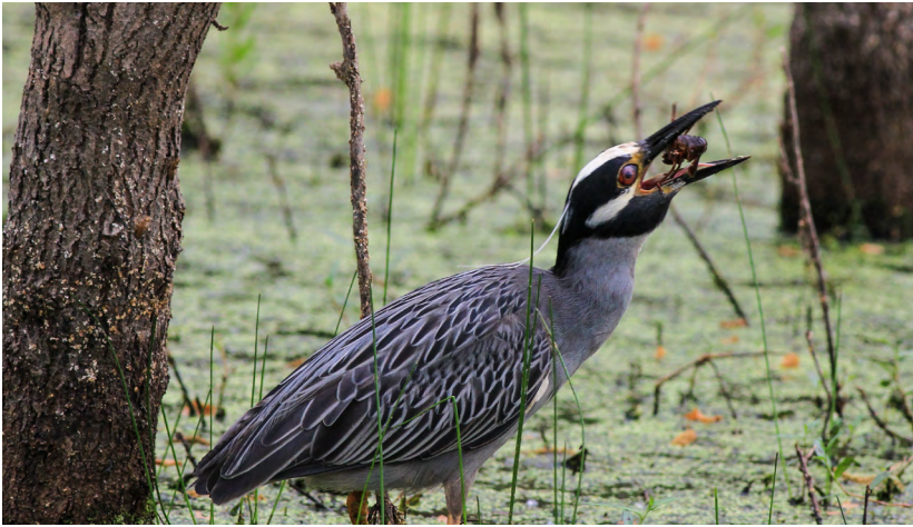
A yellow-crowned night heron enjoys a crawfish dinner in the Atchafalaya Basin. The 1.4-million acre system is home to more than 400 species of animals and plants.